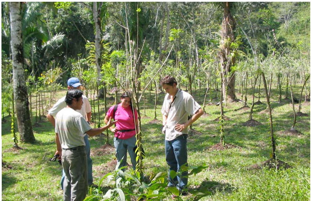
Presentation of a forest garden.

Forest gardening is based on a methodology called analog forestry, which imitates natural forests. It synthesizes scientific knowledge on conservation and biodiversity with sustainable agricultural techniques and local knowledge about home gardens, giving place to a variety of tree crops compatible with natural forest permanence. This constitutes an effort by the local farmers not only to preserve the present forest coverage but to restore the ecosystem and its biodiversity, while achieving permanent productive cropping systems dominated by trees (Del Cid and Garcia 2005).