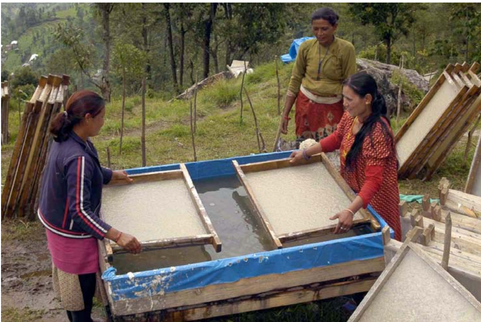
Women working in Lotka paper-making enterprise.