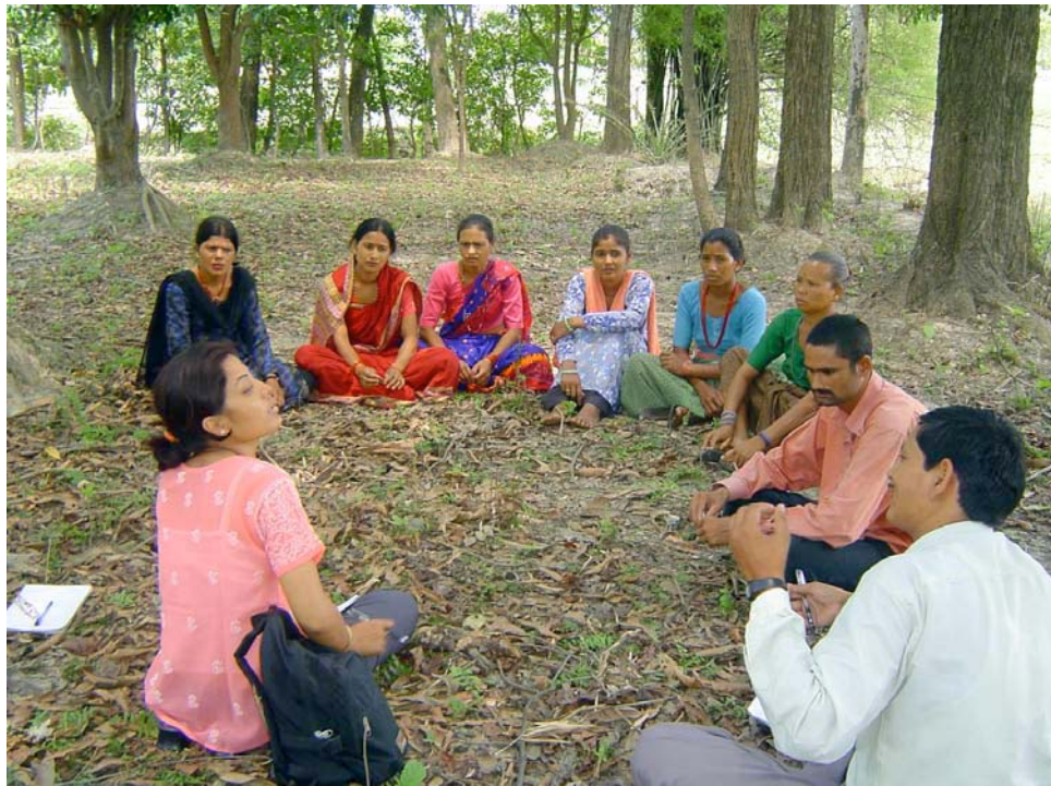
Women participating in the community forestry planning process in Nepal.

Forest user groups are new social institutions in village Nepal. Traditional social institutions in rural Nepal are often caste bound and exclude women from decision-making outside of the home. Forest user groups were conceptually developed as egalitarian organizations, where all forest users, regardless of caste, gender, or economic status, would have an equal say in the decision-making process. Elected members of the user group's executive committee are to represent all settlements included in the community forest, as well as women, caste groups, and members of disadvantaged community groups (Department of Forests 2001). Implementation, however, often runs up against village societal norms and accepted practices. For many disadvantaged, uneducated, or impoverished groups, low self-esteem also hinders their full participation in the program.