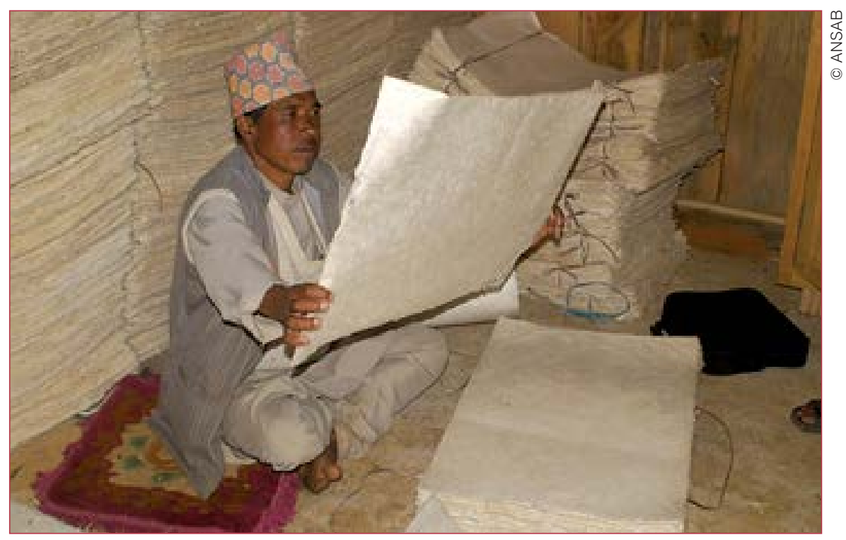
Staff at a community enterprise manually inspect the handmade paper for quality control

At the HBTL central facility in Kathmandu, further value-addition processes take place to prepare the product for trade in domestic markets and to export to international markets. The paper is graded by manual inspection into different groups according to quality, which are in turn used to make products for different consumer groups. On its premises in Kathmandu, the company has small-scale drying, printing and paper-cutting facilities to make products such as stationery, greetings cards and office items. For processes such as paper dying, calendaring (flattening) and die cutting that involve cutting a high volume of paper into the same custom shape or form, and other treatments such as adhering the paper onto cardboard or performing large volumes of silk screening, the company outsources to other companies in Kathmandu which are equipped to handle these more technical processes, and which have facilities for processing in volume.