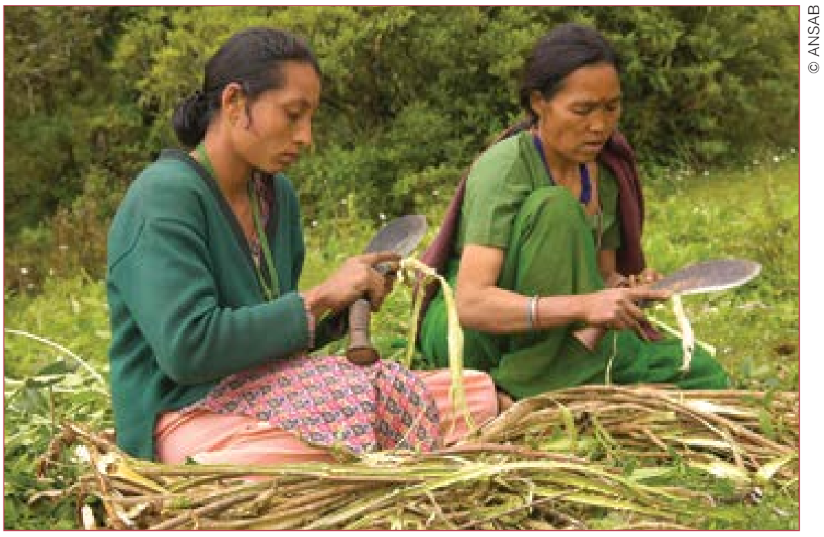
Women cleaning the lokta bark

Figure 14.1 presents the value-chain map of FSC-certified handmade paper in Nepal. Among the four enterprises providing handmade paper to HBTL, the major business volume is concentrated in two enterprises – Everest Gateway Herbs in Dolakha and Malika in Bajhang.