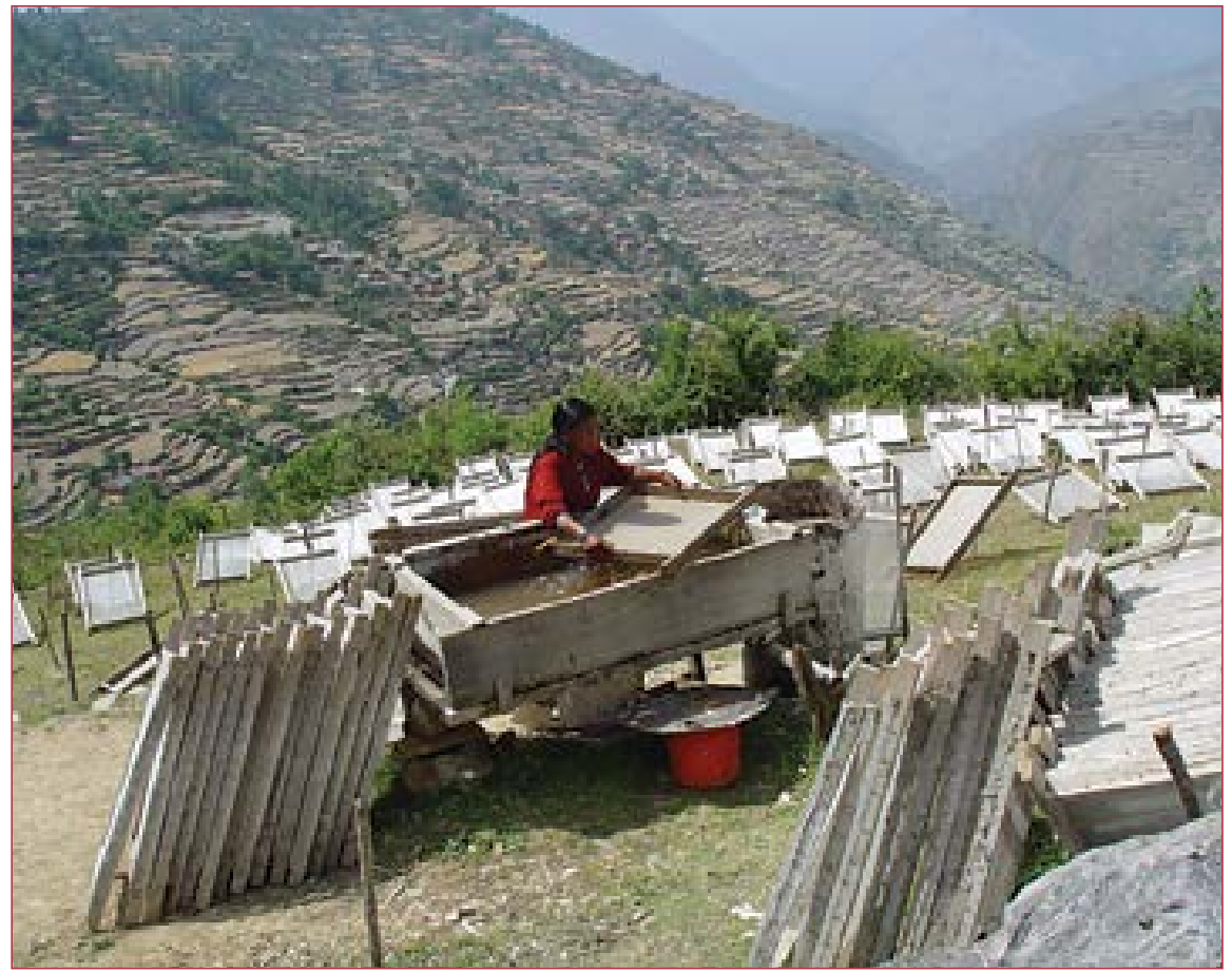
Handmade paper made from lokta pulp. The paper sheets are dried in the sun on wooden frames