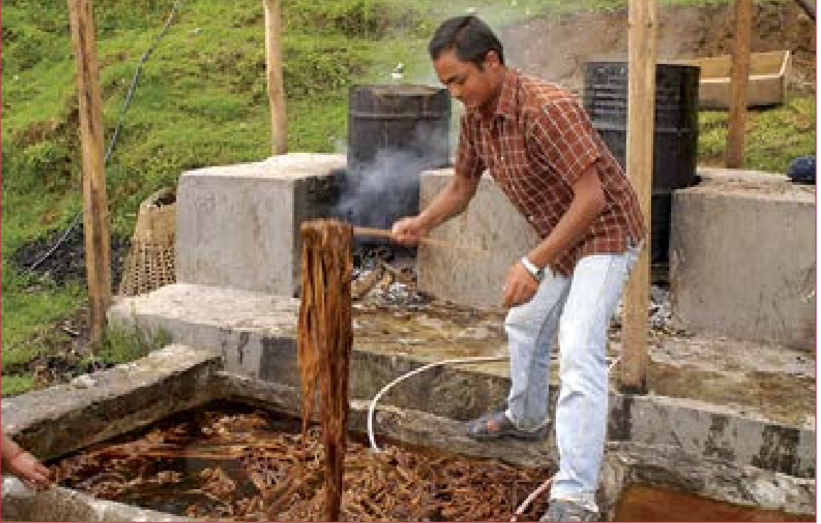
Man handling baked lokta for cleaning