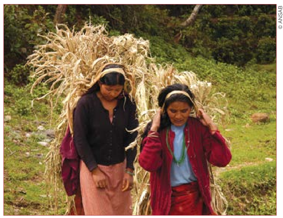
Women carrying raw lokta

HBTL organises the FSC-certified handmade paper business in Nepal. It starts at community level with the harvesting and primary processing of lokta plants and ends with the final consumers. Some are at the domestic level but most are international, mainly through Aveda. CFUGs manage the forests from where lokta plants are harvested by their members as per the CFUG operational plan and FSC-certification principles and criteria. The community members harvest and debark the lokta plants manually by using sickles and khukuri (a Nepalese knife similar to a machete), after which they dry the lokta inner bark ( bast ) in the sunlight. The community members also transport the dried lokta bark to their nearest paper-production enterprises.