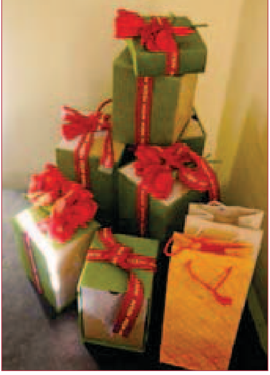
FSC-certified handmade paper is used to produce gift packaging for Aveda, a major US-based natural beauty products company

HBTL's relationship with Aveda goes back to 2002 when ANSAB developed a partnership with Aveda following the design and implementation of the Certification and Sustainable Marketing of Non-timber Forest Products Private Public Alliance (PPA) project funded by USAID. Section 14.3.1 provides details of the PPA project and it alliance members. During the project, Aveda provided much-needed private-sector guidance on the demands and requirements of the international natural products market, and expressed its willingness to support sustainable livelihood generation for rural communities, while purchasing high-quality products from Nepal. ANSAB and Aveda worked closely for the next five years with HBTL on FSC-certified handmade lokta paper, covering issues such as product quality, design, price, packaging and shipping; and in 2007 Aveda began purchasing FSCcertified paper to package their Aveda Holiday Gift line of products.