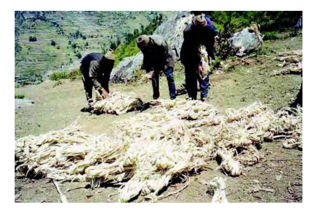
Drying lokta, Bajhang.

adviser of the Federation of Forest Users in Nepal (FECOFUN) and of the Himalayan Women's Grassroots Organisations (HIMAWANTI), Nepal.