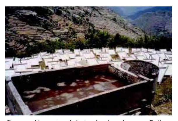
Paper-making vat and drying hand-made paper, Bajhang.

"The area around Kailash Village is endowed with abundant lokta resources," Bhishma elaborated. "This is a preferred raw material for handmade paper.